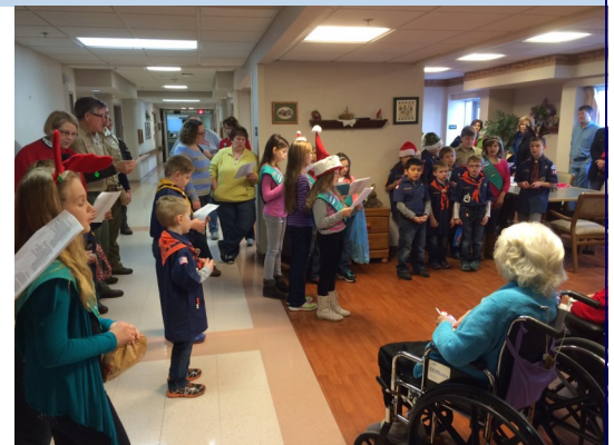
Boy and Girl Scouts caroling on 1 North.

A BIG thank you to all of the various individuals, volunteers, staff, family members and community groups that donated items or talents to our residents during the holiday season. Each resident received a personalized bag of toiletries, treats and items all donated to Rocky Knoll. Your generosity this Christmas season has made the season more enjoyable for those living at Rocky Knoll. Thank you for your thoughts during the Christmas season as well as throughout the year. We are truly blessed to have your support for our facility and its programs.